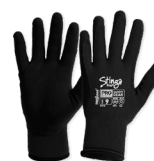
PROSENSE STINGA FROST INSULATED GLOVES