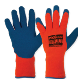
PROSENSE ARCTIC PRO GLOVES