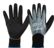
PROSENSE TOUCH SCREEN SAND GRIP WINTER GLOVES